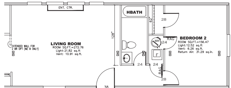
2 BEDROOM OPT.